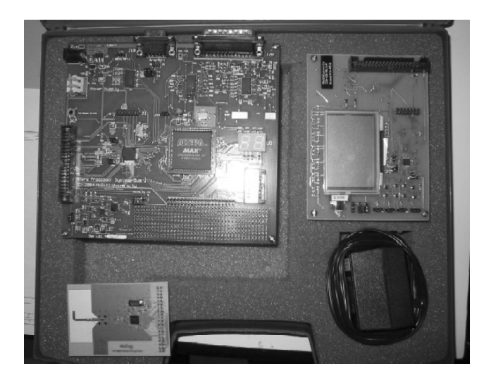
Fig. 2. Teaching kit photograph showing the McGumps main board (upper left), McGuld LCD with touch panel (upper right), and the McZig RF interface (lower left).